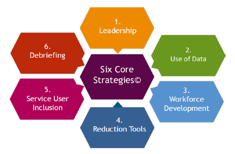
Figure 3. Six Core Strategies for Reducing Seclusion and Restraint Use<sup>©</sup>. Adapted from: National Association of State Mental Health Program Directors (2008).

The Six Core Strategies framework utilises a whole-of-system approach towards least restrictive practice (National Association of State Mental Health Program Directors, 2008). The framework consists of six strategic domains, as shown in Figure 3.